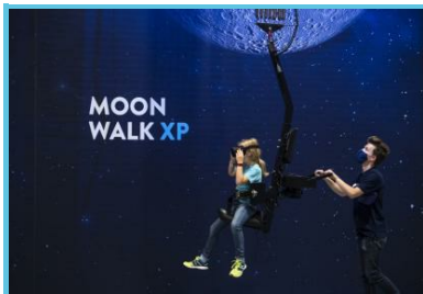
Euro Space Center