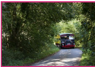
© Crocodile Rouge - Jean-Francois Baelden

From Monday 06 April 2020 to Friday 06 November 2020.