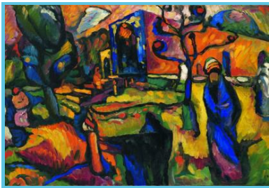
MUDIA - Vassily Kandinsky, Les arabes, 1909

From Wednesday 01 January 2020 to Thursday 31 December 2020.