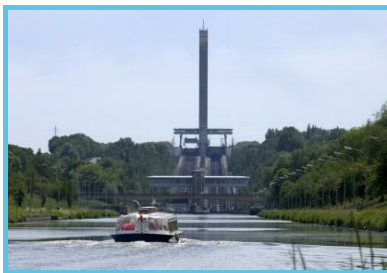
H.C.T - C.Carpentier