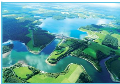
Les Lacs de l'Eau d'Heure