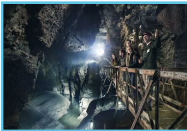
Domaine des Grottes de Han